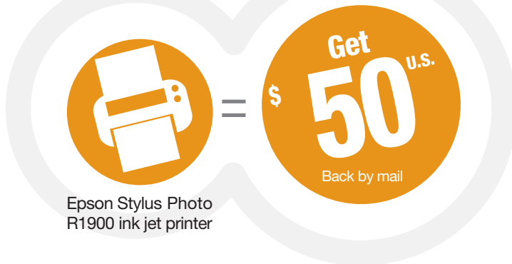
Epson Stylus Photo R1900 ink jet printer

Buy an Epson Stylus® Photo R1900 ink jet printer and receive the following back by mail: